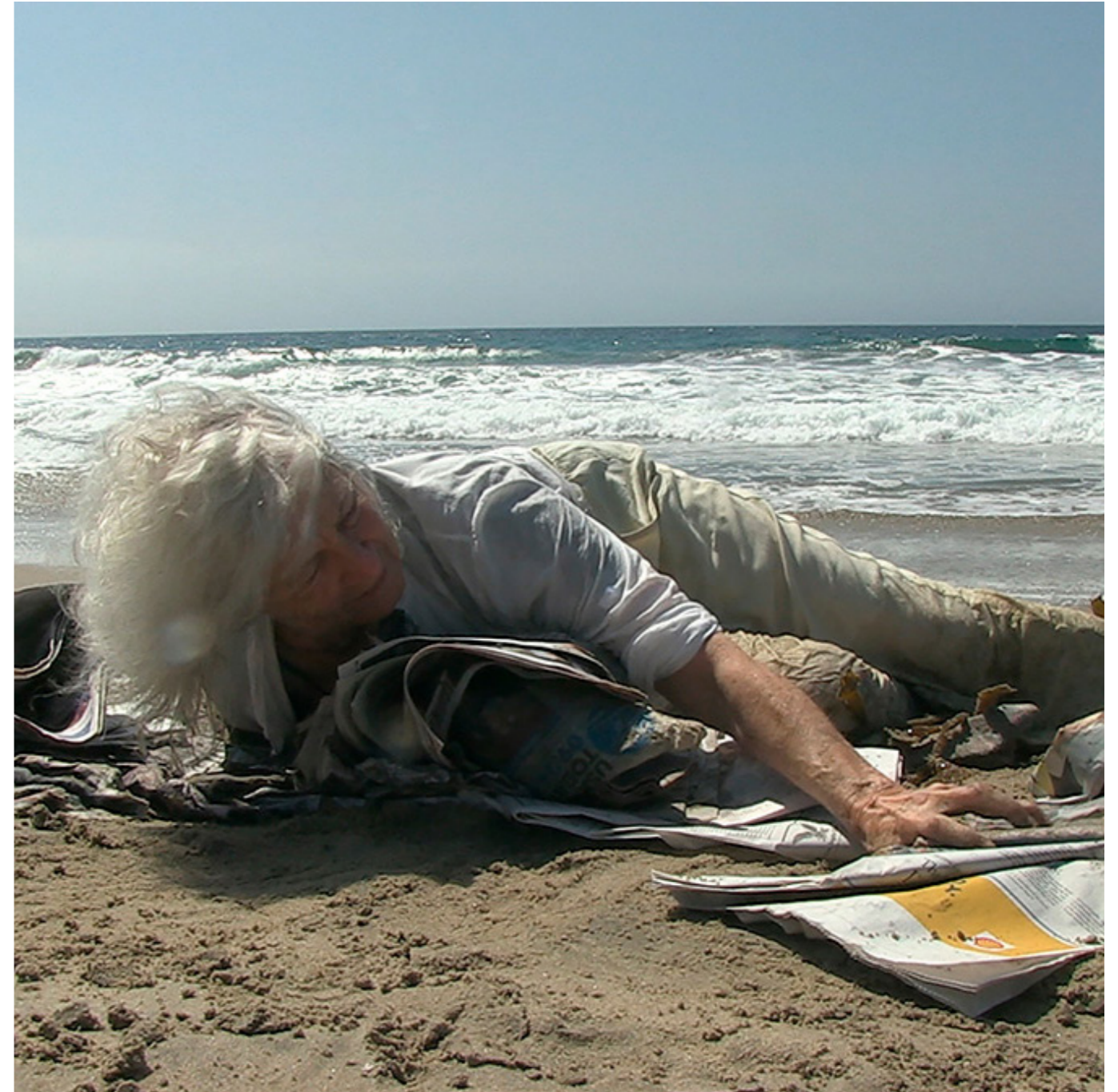
Simone Forti, Zuma News , 2014, video, courtesy of the artist, the BOX Gallery, Los Angeles, and Galleria Raffaella Cortese, Milano

The artist and writer Simone Forti, born in Italy in 1935, has been a leading figure in the development of contemporary dance and performance ever since the 1950s. Her work has reinterpreted the male-dominated narrative of conceptual art, with her feminine delicacy and emotion-driven movements exploring 'natural,' or nonformalist, movement and dance. Her seminal work, the 'Dance Constructions' (1961) have influenced many dancers and artists. She mastered her practice through constant improvisation and experimentation — her oeuvre spans from dance performances, video art and paintings, to drawings, photography and literature. Forti is an iconic female artist who reconfigured the concept of performance and dance by constantly engaging within the dialogue between visual art, dance and nature.